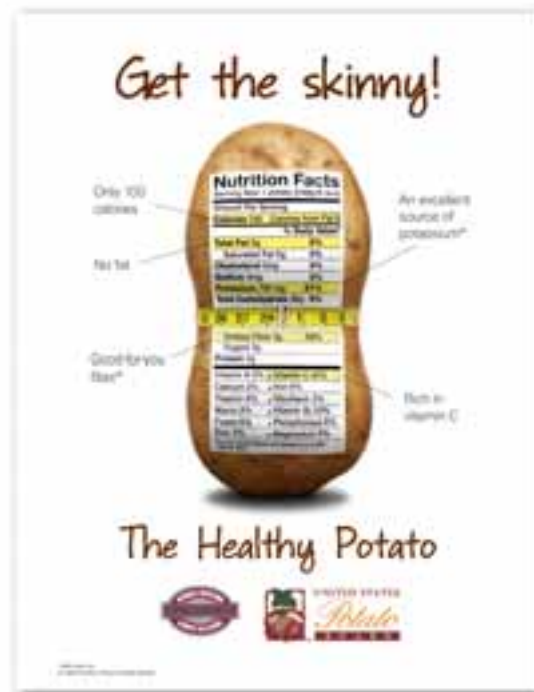
High-impact point-of-sale materials help you merchandise healthy potato options.

Grown and used most often in the Eastern United States, these potatoes are available year-round. Round and long whites are medium in starch level and have smooth, light tan skin with white flesh. They are creamy in texture and hold their shape well after cooking.