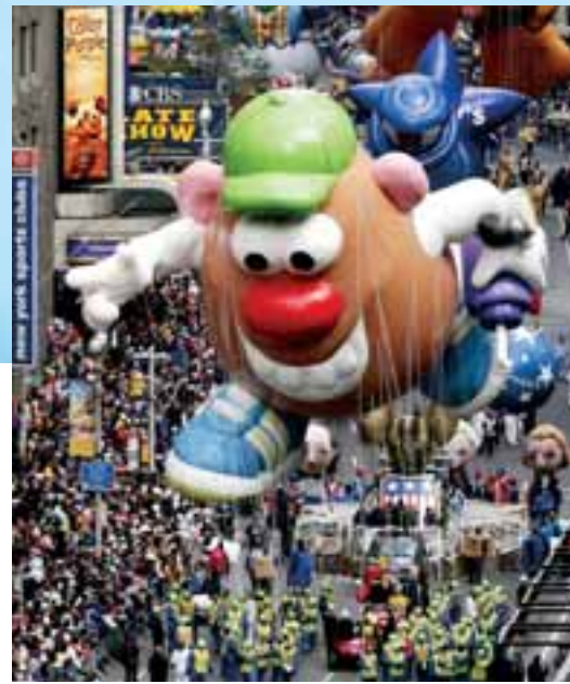
Health spud: The U.S. Potato Board's Healthy MR. POTATO HEAD™ character, which made its debut at the Macy's Thanksgiving Day Parade®, has reached millions of Americans with the message that potatoes can be part of a healthy diet.

WHEN IT COMES TO POTATOES AND HEALTH, it's all about perception and reality. The reality is that they fit easily into current dietary guidelines for healthy eating. And the U.S. Potato Board is working overtime to make sure your customers get that message.